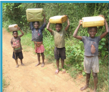
Walking miles to get Water.