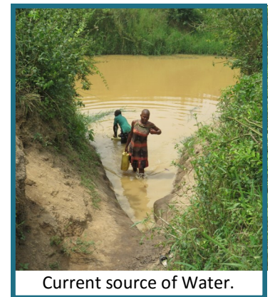
Current source of Water.